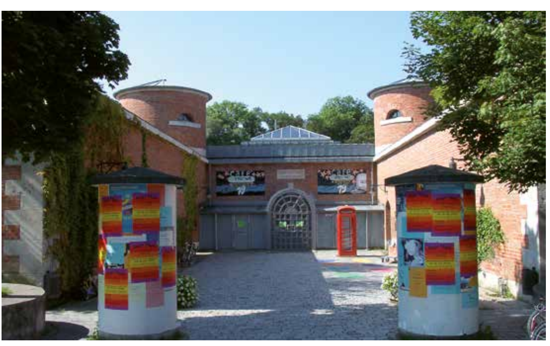
Youth culture centre Fronte 79

Town district oriented open work, with a focus on children and youths from the Northeast of the city