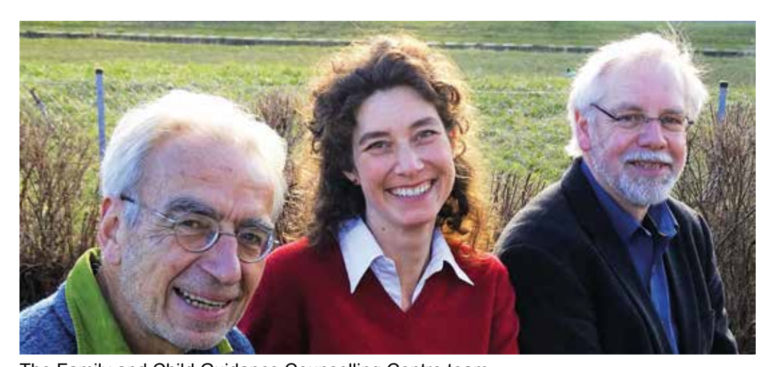
The Family and Child Guidance Counselling Centre team